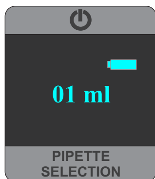
OLED SCREEN VIEW

Large easy-to-read monochrome display screen adds a layer of protection against accidental impacts, scratches and chemical spills.